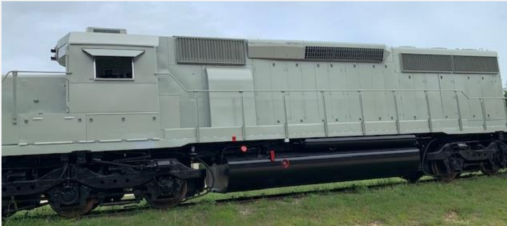
Picture of actual unit

These locomotives have been completely overhauled per attached work scope and are ready for the customers paint colors to be applied. 2 units left. Call today for details.