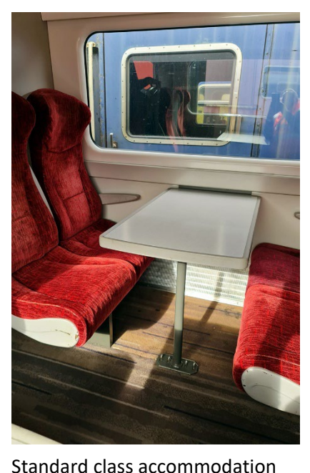
Standard class accommodation