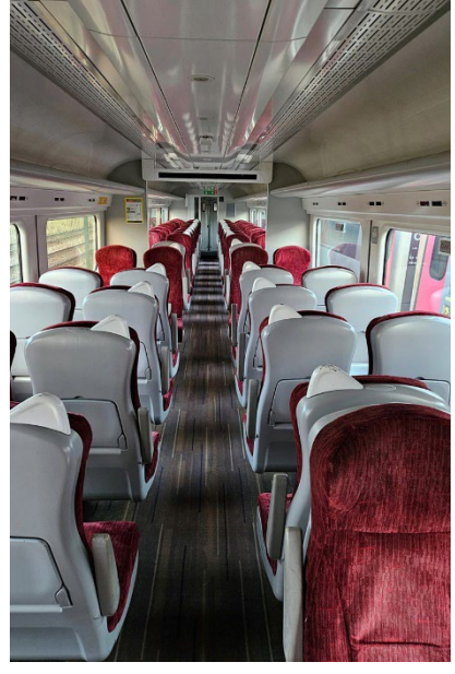
Standard class accommodation