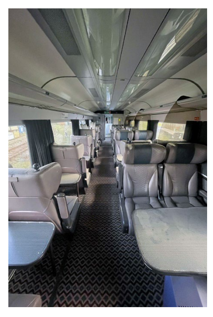
First class accommodation