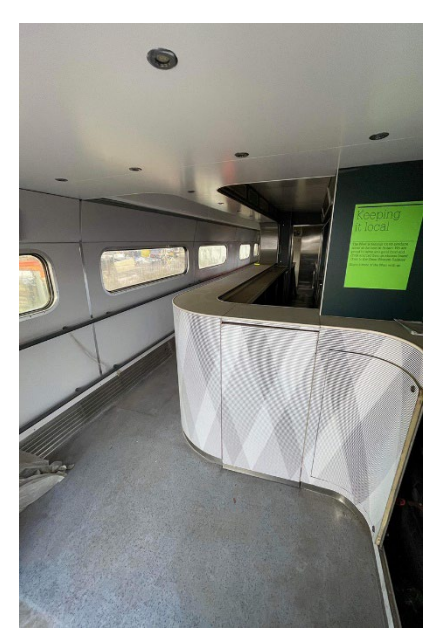
Buffet coach counter area