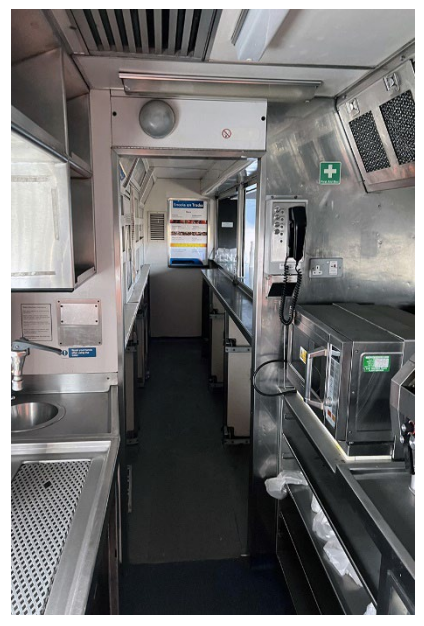
Buffet coach catering area