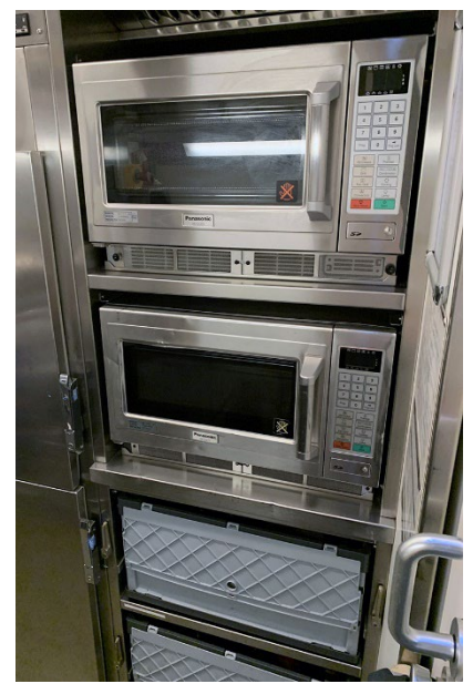
Buffet coach catering area