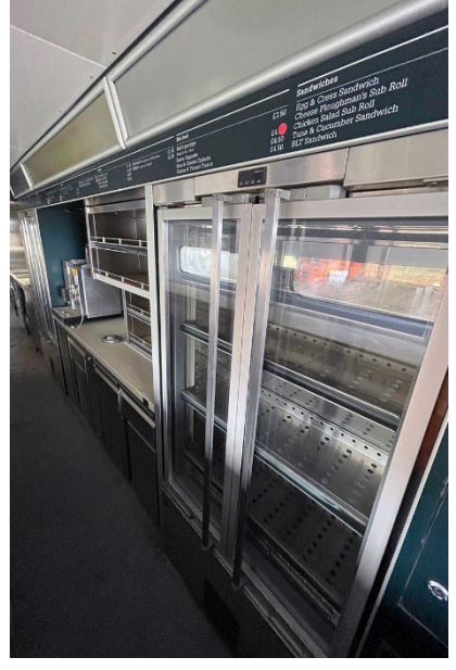
Buffet coach catering area